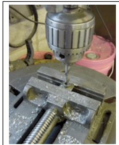
FIGURE 2 Drill rear fender nuts