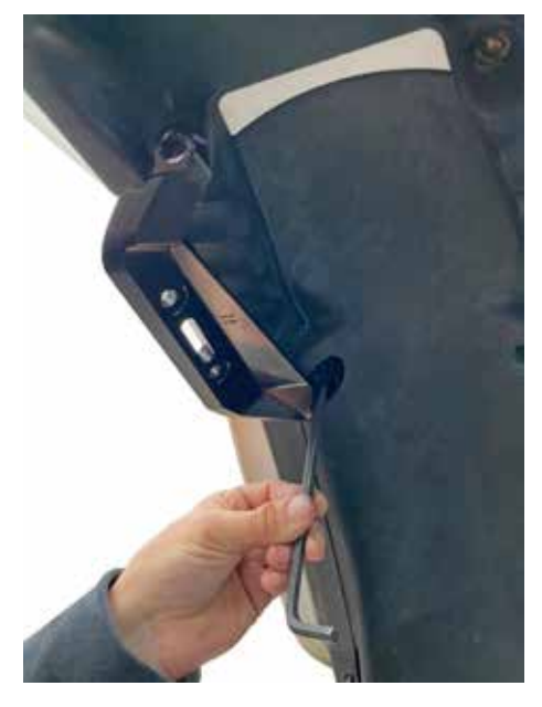
2. Using one M8x25 bolt install the mount bracket as shown.

1. Remove all 6 bolts from under the rear fender. Labled A,B and C