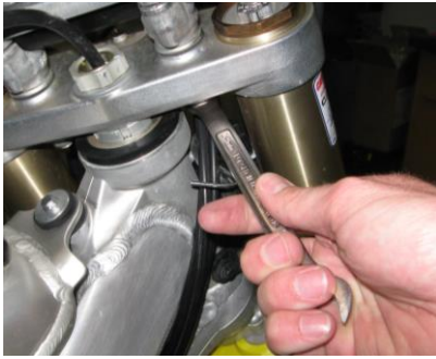
Figure 1: UNDERBAR MOUNT ONLY